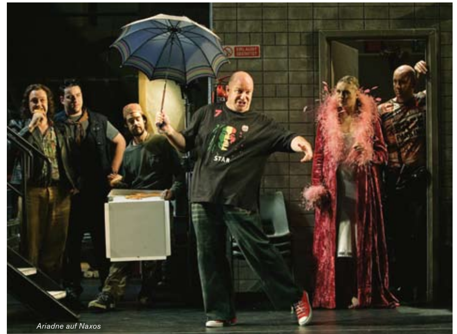
Ariadne auf Naxos

*To be eligible for the dress rehearsal tickets, youth must attend both components of the Youth Opera Lab (workshop and rehearsal).